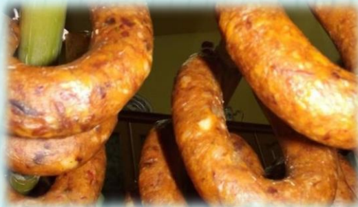
Alheiras (a type of sausages made of bread and different kinds of meat)