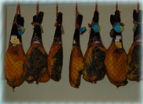
Smoked pork meat

This region really worthes a visit (In this area in can have plenty of good and tradition food: