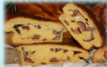
Folar(Baked bread with eggs and meat)