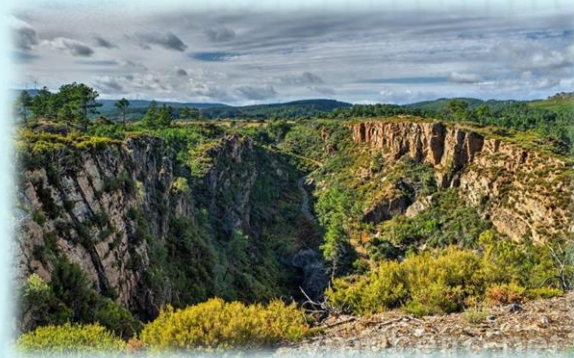
Roman Mining Complex